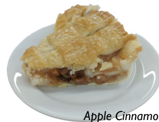
Apple Cinnamon Raisin Pie

Ask your server what our fresh pie of the day is! Add a scoop of whipped cream for only $1 more!